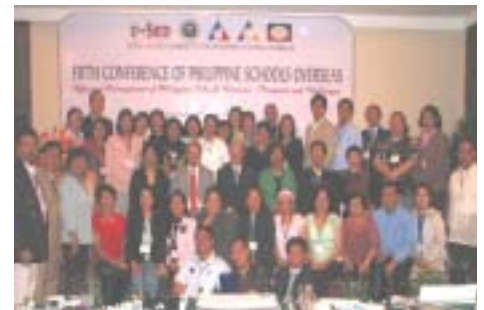
Forty five participants from 25 Philippine Schools Overseas pose with members of the IACPSO as they gather in Xiamen, China for the Fifth PSO Conference.

Pursuant to CFO Board Resolution No. 2006-02, CFO fees are increased effective 01 August 2006 as follows: