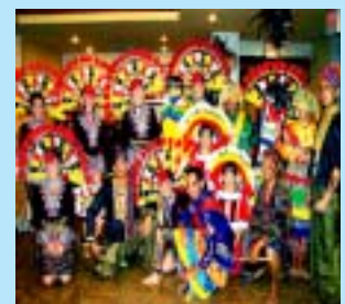
The Sining Kambayoka dance troupe pose during a break in performances at the Honolulu Festival.

The Honolulu Festival started in March 1995 when various ethnic associations in Japan and Hawaii in partnership with public and private sectors, decided to put up the initial staging of the Honolulu Festival. Today, it has become Hawaii's premier cultural event, "promoting understanding, economic cooperation and economic harmony" among the people of Hawaii and the Asia Pacific region.